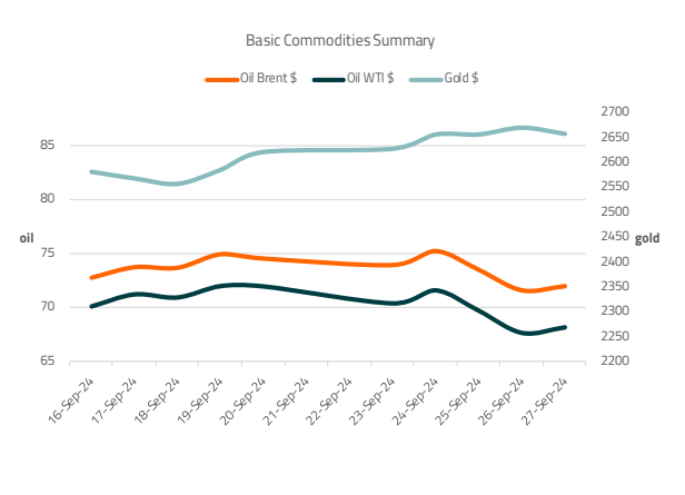
Basic Commodities Weekly Summary